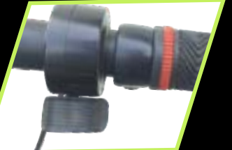
Throttle Simply Twist & go at 25km/hr speed