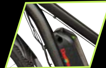
High Tensile Steel Frame