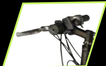
Wider Alloy Handle Bar