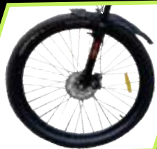
27.5 Wheel Double Wall Alloy Rim