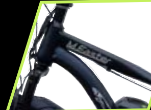
High Tensile Steel Frame