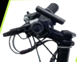
Wider Alloy Handle Bar