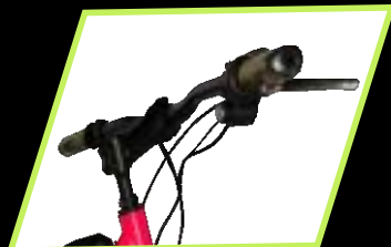
Wider Alloy Handle Bar