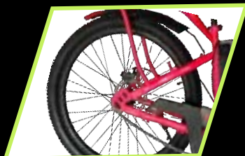
27.5 Wheel Double Wall Alloy Rim