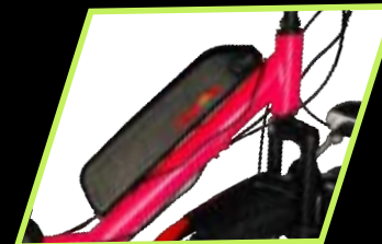
High Tensile Steel Frame