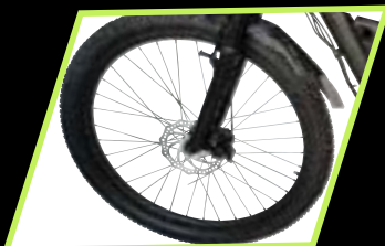
27.5 Wheel Double Wall Alloy Rim