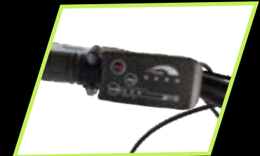
Smart LED Display